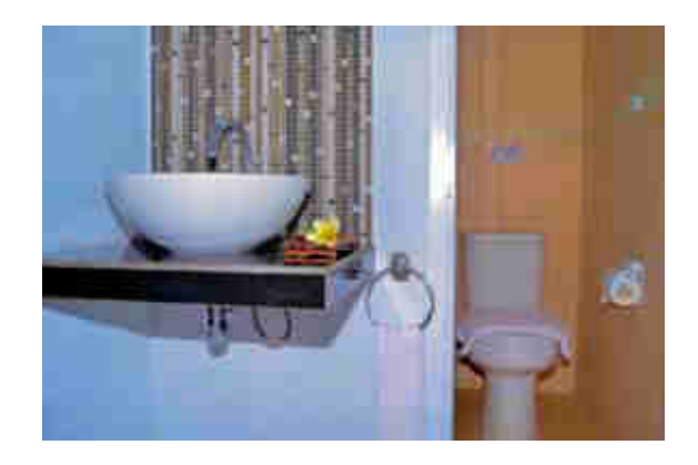
The B-TV-Home bathroom

Each room has been styled for comfort and comes with air-conditioning, television and additionally other essential conveniences such as a mini bar and free Wi-Fi coverage.