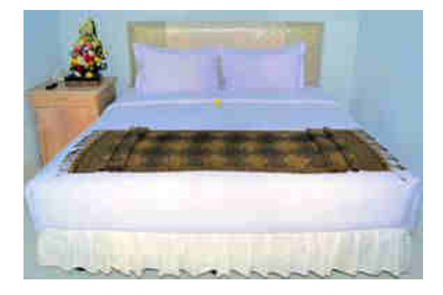
The B-TV-Home bedroom

It is an inexpensive option for families, small groups, business executives and students visiting the island of Bali.