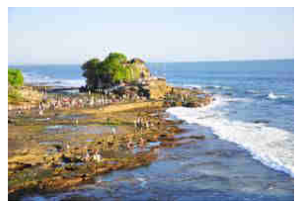
Visit Bali 1 Seminyak - Tanah Lot Temple