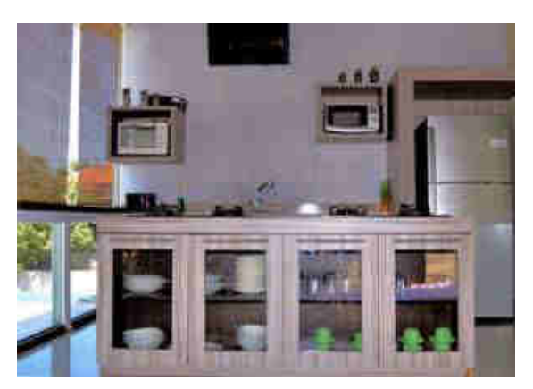
The B-TV-Home kitchen

The B-TV-Home anticipates the needs of its guests with standard facilities to enhance the quality of each and every stay here in Bali.