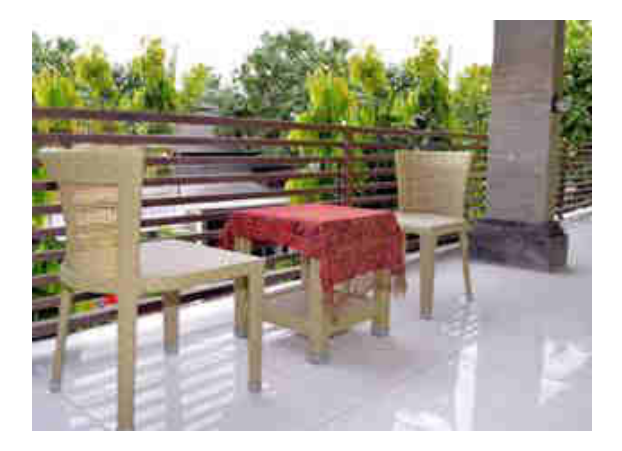
The B-TV-Home open terrace

All guests are free use the hotel's kitchen to prepare snacks or even cook their own meals. This is the ideal solution for travellers on a budget or anyone with special dietary needs.