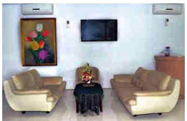
The B-TV-Home lobby

Bali Tulip Vacation Home (B-TV-Home) is a smart property featuring just 18 rooms and supporting facilities. This property is conveniently located for business and pleasure. It is a lively area that is a colourful mix of commercial and residential activities for members of the local community.